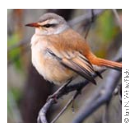
Kalahari scrub-robin ( Cercotrichas paena ), a cheerful resident of the arid north-western areas of the basin.

The key water resources quality issues in the Orange–Senqu River system have been identified as nutrient enrichment, primarily linked to increased phosphorus and nitrogen concentrations; increased salinity from acid mine drainage and irrigation return flows; microbial contamination from urban settlements and poorly operated sewage treatment works; and changes in sediment load. In addition, radionuclides, heavy metals and persistent organic pollutants, while not currently posing a basin-wide risk, do show high concentrations in certain localised areas. Therefore precaution should prevail. Although