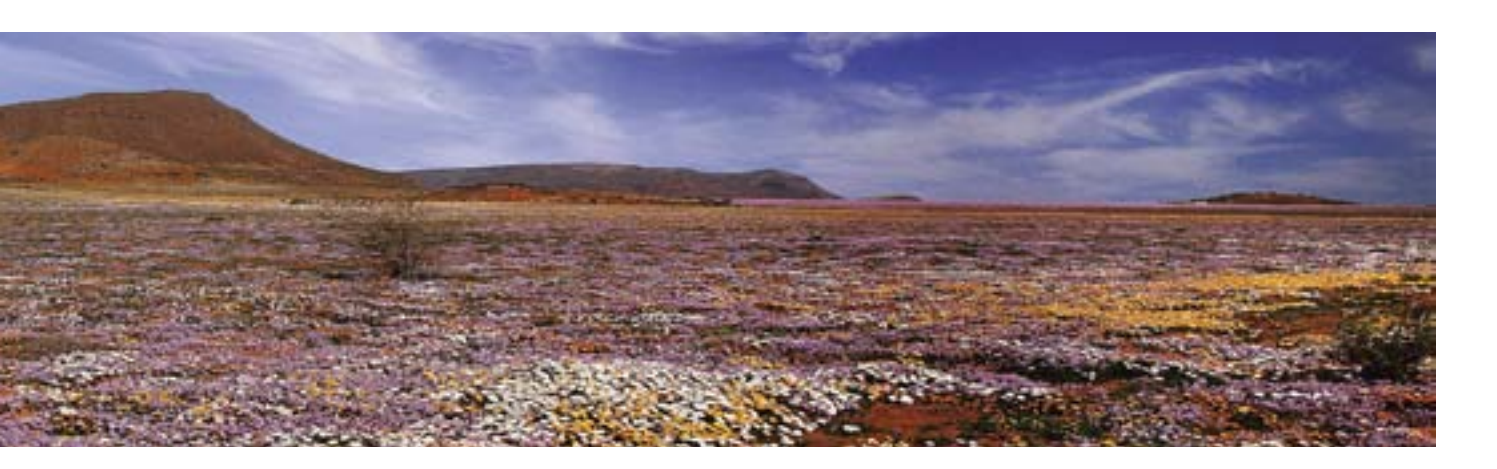
Table 2: Catchment areas comprising the basin