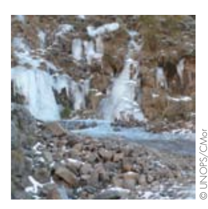
Winters can be extremely cold in Lesotho, especially in the highlands, as shown by this frozen stream.

South Africa is a constitutional parliamentary democracy with three spheres of government: national, provincial and local. The National Water Act (No. 36 of 1998) establishes the principle that as the public trustee of the nation's water resources, the national government, acting through the Minister of Water and Environmental Affairs, ensures that water is protected, used, developed, conserved, managed and controlled in a sustainable and equitable manner, for the benefit of all persons and in accordance with its constitutional mandate. Significantly, the Act makes specific provision for South Africa to meet its international water obligations. South African water management legislation is firmly rooted in the principles of IWRM. The National Water Act requires the preparation of the National Water Resources Strategy, the second of which is currently in operation. The process of establishing catchment management agencies for the Water Management Areas in the country is ongoing. The National Environmental Management Act of 1998 further provides for integrated resource management.