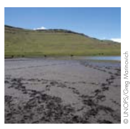
Lets'eng-la-Letsie, the Ramsar site at the source of the Quthing River in Lesotho is under threat from overgrazing and trampling by livestock.