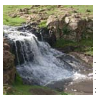
A pristine stream in Lesotho

Opposite page: Donkeys at a pan near Zutshwa, Botswana. Seasonal surface waters are an important source of water for livestock and wildlife.