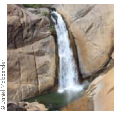
Secondary falls at Augrabies, Northern Cape, South Africa, before the water disappears underground to emerge further downstream.

he development of this Strategic Action Programme (SAP) was funded by the Governments of Botswana, Lesotho, Namibia and South Africa, as well as the Global Environment Facility (GEF).