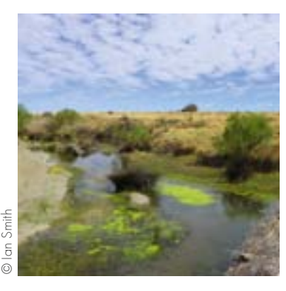
Increased nutrients in the water encourages the growth of algae, which in turn reduces oxygen content and stream health.