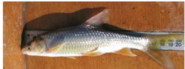
Right: Harder, found in the estuary and along the sandy beaches, is commercially important.

Nowadays, however, the reduction in the river's mean annual runoff, alteration of natural flow patterns, and man-made obstructions in the estuary probably disrupt these movements to some extent. Given that the Orange River estuary is one of only three large estuaries on the west coast, further changes that risk destroying the estuary's functioning could shrink the range of estuarine-dependent species by at least 400 kilometres southwards to the Olifants River estuary.