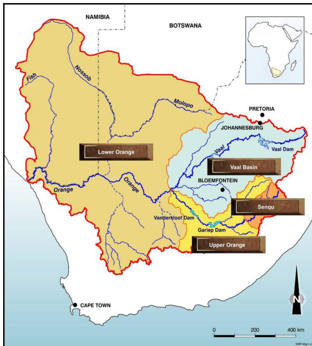
Figure 1.1: Orange-Senqu River Basin

The Orange - Senqu River basin as shown in Figure 1.1 originates in the highlands of Lesotho some 3 300m above mean sea level, and it runs for over 2 300km to its mouth on the Atlantic Ocean. The river system is one of the largest river basins in southern Africa with a total catchment area of more than 850,000km 2 and includes the whole of Lesotho as well as portions of Botswana, Namibia and South Africa. The natural mean annual runoff generated within the basin is estimated to be in the order of 11 900 million m 3 based on the 1920 to 2004 period of record. The flow reaching the Orange river mouth has been significantly reduced by extensive water utilization for domestic, industrial and agricultural purposes as well as several major interbasin transfers, both into and out of the Orange/Senqu basin. Based on the most recent assessments, the average annual flow reaching the Orange River mouth is estimated to be approximately 3 700 million m 3 which comprises the environmental requirements of the river mouth as well as the intermittent floods.