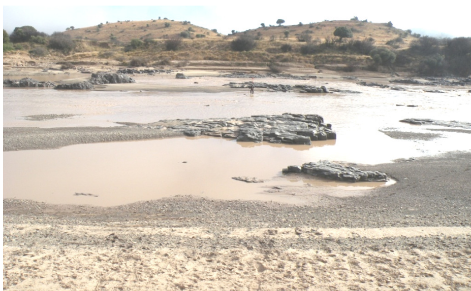
Figure 8.1 The bed at this site is being smothered by fines deposits. This is reducing inchannel habitat diversity.