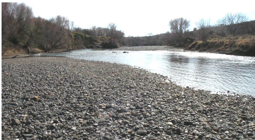
Figure 9.1 This pool-riffle reach comprises mobile well-sorted cobble and gravel beds. The reach is considered to be close to the Reference conditions.