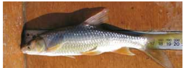
Right: Harder, found in the estuary and along the sandy beaches, is commercially important.

Nowadays, however, the reduction in the river's mean annual runoff, alteration of natural flow patterns, and man-made obstructions in the estuary probably disrupt these movements to some extent. Given that the Orange River estuary is one of only three large estuaries on the west coast, further changes that risk destroying the estuary's functioning could shrink the range of estuarine-dependent species by at least 400 kilometres southwards to the Olifants River estuary.