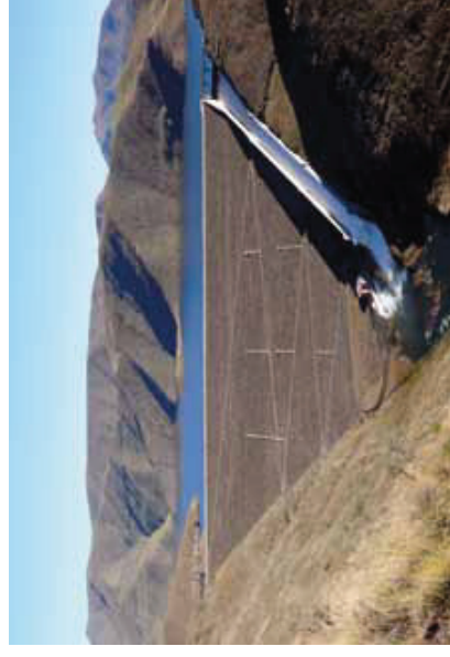
Mohale Dam, part of the Lesotho Highlands Water Project