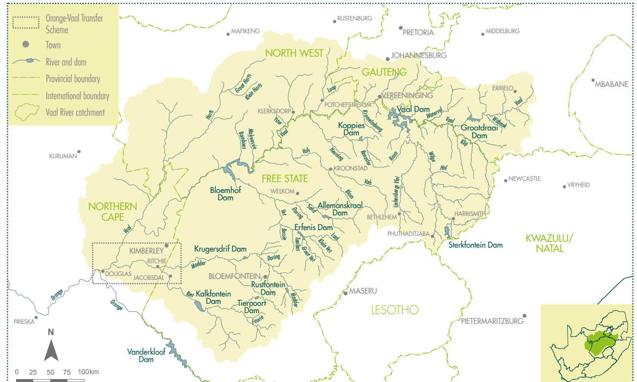
Upper Orange Transfer Scheme (from map produced by the SA Department of Water Affairs)

The Alberton Canal (or Atherton Canal): Water is released from Douglas Weir via an unlined third canal, the Alberton Canal, which runs along the right-hand side of the Vaal River to the Atherton Plots.