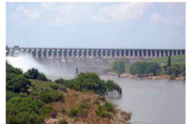
Vaal Dam