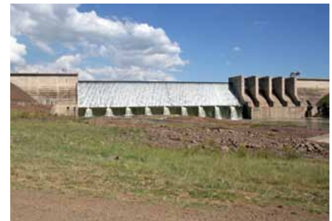
Grootdraai Dam