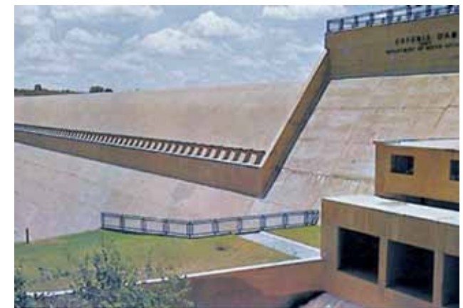
Erfenis Dam