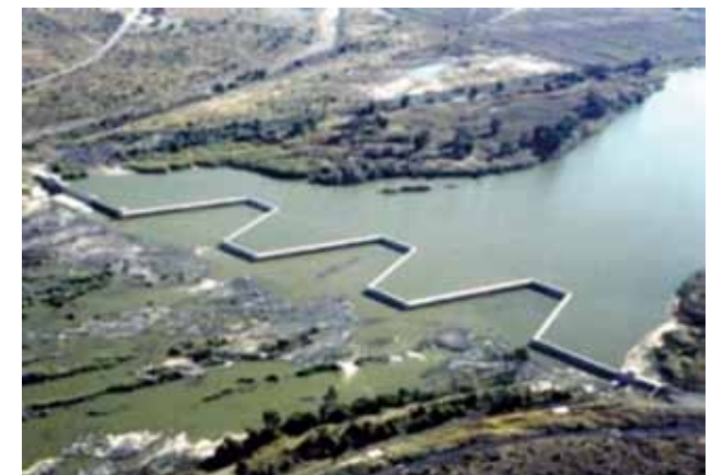
Douglas Storage Weir