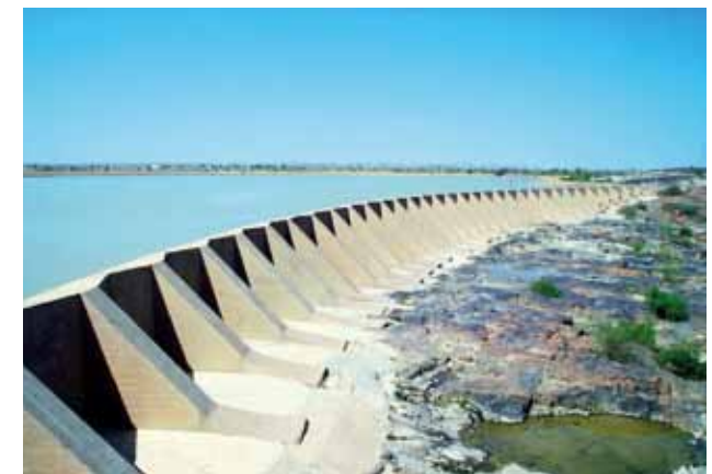
Bondels Dam