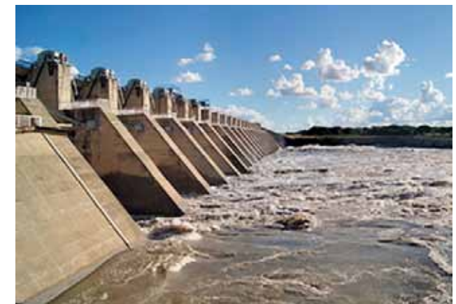
Bloemhof Dam