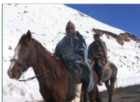
The climate of Orange-Senqu River basin varies from snow in the winter in Lesotho... ( click to enlarge )