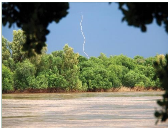
Lightning during a storm on the Lower Orange River. ( click to enlarge )

Our global climate is changing. The question is, when and where the changes will take place, and what the impacts will be on our local environment and livelihoods? These are profound questions for the Orange-Senqu River basin, with much of the basin already in a state of water scarcity; a situation that is already presenting water managers and planners with significant challenges in terms of water quality, distribution and allocation.