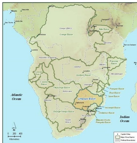
The International Basins of Southern Africa. (click to enlarge)

The map below shows the distribution of transboundary river basins in the Southern African Development Community (SADC) region.