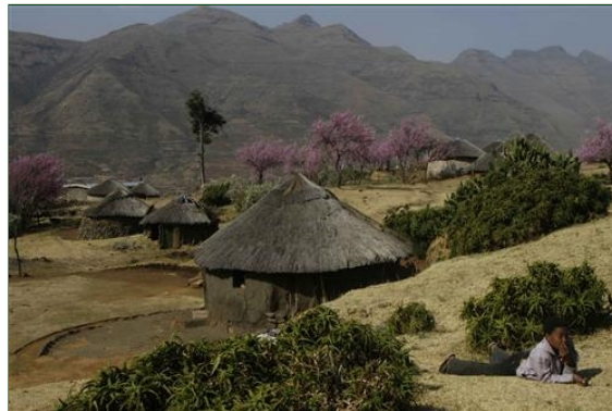
A typical rural village in Lesotho. ( click to enlarge )

Next: The Basin as a Socio-Economic Entity