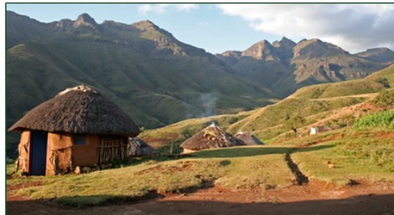
The highlands of Lesotho, the source of the Orange-Senqu River. ( click to enlarge )