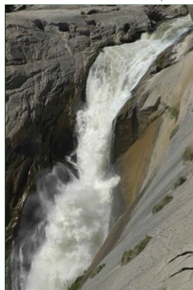
Augrabies Falls, on the lower reaches of the Orange-Senqu River, South Africa. ( click to enlarge )