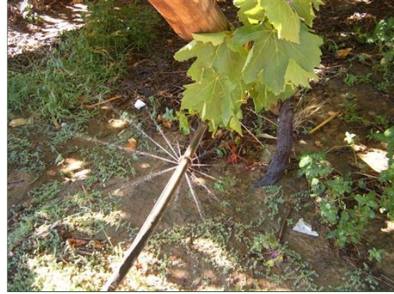
High value crops, such as table grapes, require irrigation throughout the year. (click to enlarge)

There are currently 2 490 ha under irrigation in the two main irrigation projects in the Fish River Basin in Namibia – 2 260 ha at Hardap Dam (AquaStat Namibia 2009) and 290 ha at Naute Dam. There are also a number of riparian farmers along the river that are irrigating small areas of land. Since the river is not perennial, these farmers can only periodically abstract surface water.