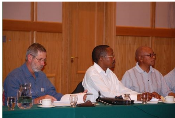
ORASECOM provides a platform for discussion.

(click to enlarge)