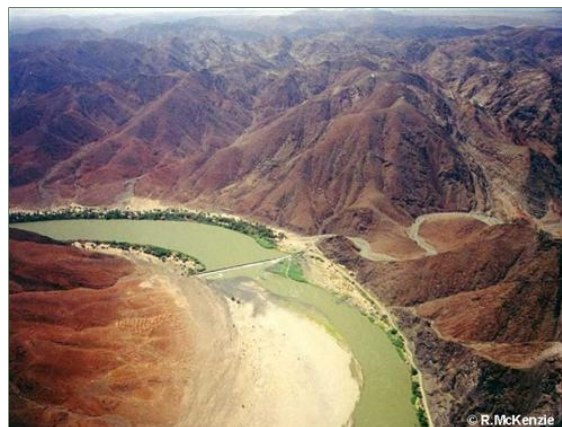
The Orange-Senqu River is a shared watercourse.

The Revised Protocol was ratified by all of the Orange-Senqu riparian states and is binding on them. The agreement stipulates that any institutions established within the region, such as River Basin Organisations, must implement the principles of the Revised Protocol (ORASECOM 2007). A copy of the Revised Protocol is available in the Document Library .