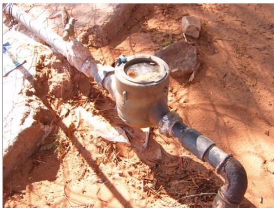
A conventional water meter in rural Namibia.

In Namibia the water flow accounts consider the source of water (natural and the supply agency), as well as the end-user. "Use"—losses not accounted for—are also considered in the accounts. There are 26 classifications of users in Namibia across the primary, manufacturing, service, government and household sectors.