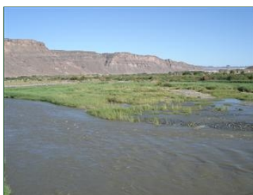
The Lower Orange River in Namibia.

( click to enlarge )