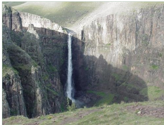
Maletsunyane Falls, in Lesotho.

For more details turn to the History and Water-Related Culture section in the "People and the River" theme.