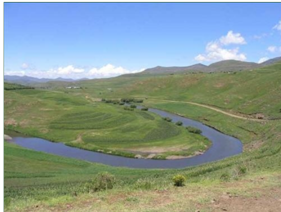
Maletsunyane River - one of the many sources of water that will be included in the accounts.

Although no water accounts have been compiled for Lesotho to date, a discussion about the economic valuation of water in Lesotho can be found in the Lange et al. (2007) study: Water accounting for the Orange River Basin: An economic perspective on managing a transboundary resource.