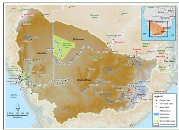
The basin states of the Orange-Senqu River. (click to enlarge)

Next: Socio-economic portrait of Botswana