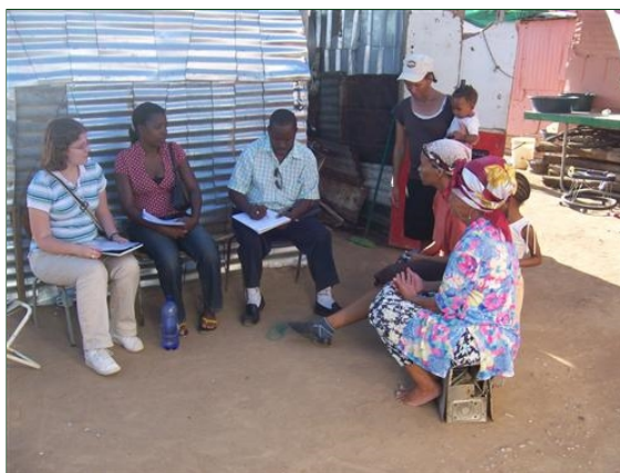
A range of stakeholders should be included in IWRM and IRBM.