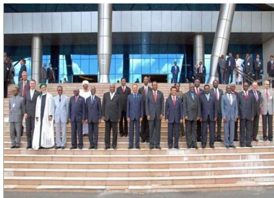
SADC Heads of State and Ministers of Water at the SADC Consultative Conference, Mauritius, April 2008.

The SADC Regional Strategic Action Plan (RSAP) for Integrated Water Resources Development and Management is the SADC Water Sector's implementation plan; it gives practical effect to the implementation of the SADC Protocol on Shared Watercourse. This is discussed in more detail in the section specifically related to the Action Plan .