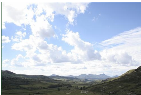
Laws and Policies are in place to protect the natural resources of the basin.

Within the Orange-Senqu basin, large differences exist between the national water laws (Hiddema and Erasmus 2007). In South Africa the water law is comprehensive and unified in one newly-developed Act, and supports decentralised water management. Namibia is currently in the process of combining multiple old water Acts and one new, integrated water bill (Kranz et al. ). Lesotho and Botswana are also in the process of revising their water legislation.