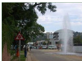
Leaking water pipes account for huge water losses.

(click to enlarge)