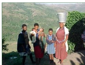
Meeting rural water requirements.

(click to enlarge)