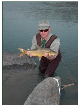
Small Mouth Yellowfish (Rubber Lips). (click to enlarge)