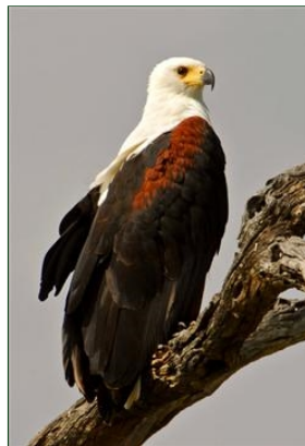
African Fish Eagle. (click to enlarge)

The aquatic ecosystem of a river system is generally comprised of its fish, aquatic invertebrates, riparian plants, and microorganism components. Key issues related to aquatic habitat and riparian vegetation are described below, in terms of system drivers and habitat response to stressors.