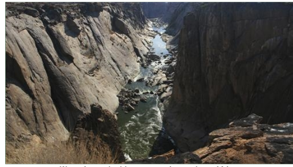
Water is a valuable resource in southern Africa. ( click to enlarge )