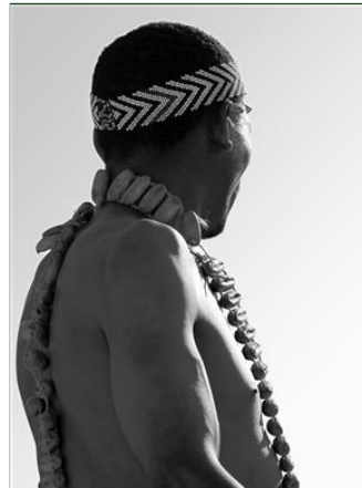
A member of the San people in traditional costume.