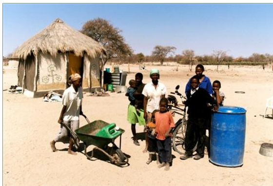
River basin stakeholders range from river basin organisations to community based organisations.

This chapter discusses the River Basin Organisations stakeholders at the international, regional and basin level role within the Orange-Senqu River basin. The various national governments and local governments responsible for managing water resources within the member states of the Orange-Senqu River basin are presented, as well as examples of international and national Non-Government Agencies (NGOs) and Community Based Organisations (CBOs) within the member states. Also the role of International Cooperating Partners (ICPs) is discussed.