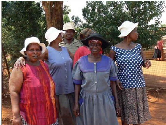
Inhabitants of Orange Farm, South Africa, south of Johannesburg. ( click to enlarge )