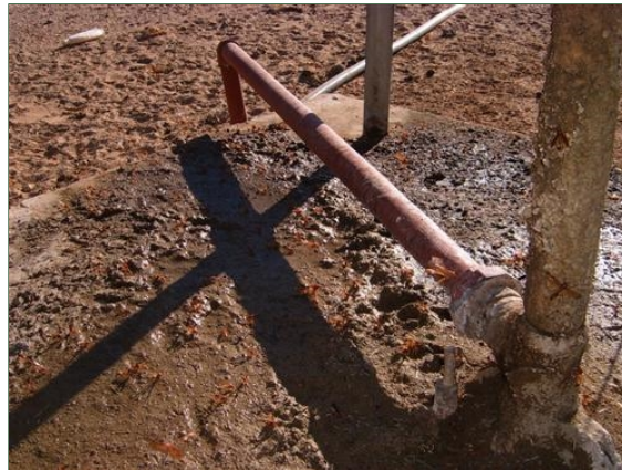
Hardness can damage valves and cause leaking on pipes and other infrastructure.

Hardness in water is a common problem in the Orange-Senqu River basin, especially in supplies from groundwater sources. Water hardness can cause scaling in water pumps and damage valves, pipe fittings and other infrastructure, especially in rural systems that use very hard.