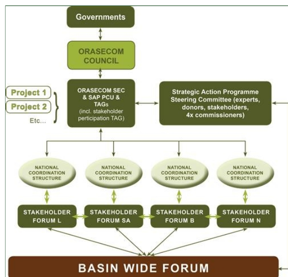
The institutional interfaces for stakeholder participation in the Orange-Senqu River basin. (click to enlarge)

The figure below shows the established ORASECOM institutional interfaces to promote effective stakeholder involvement.