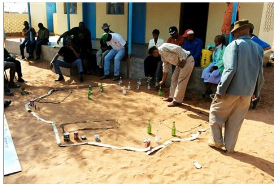
Stakeholders draw a participatory map.