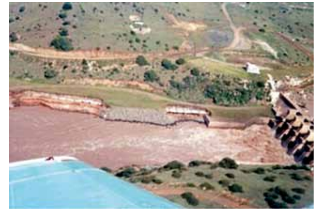
Welbedacht Dam