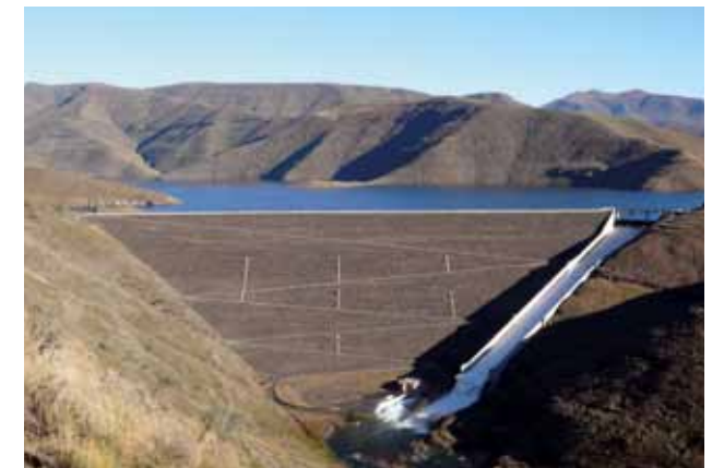
Mohale Dam