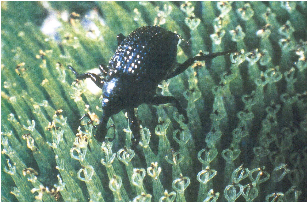
Cyrtobagous salviniae , the biological control agent, which is successfully controlling the invasive aquatic weed Salvinia molesta , Kariba weed, in the Eastern Caprivi.

Future threats include new introductions via the nursery and pet trades, reforestation programmes, game farming and expanding aquaculture enterprises.